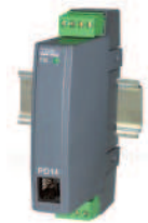
Programmable transducer of temperature, resistance, voltage from shunt and standard signals - P20